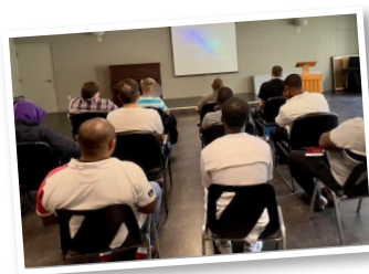
Participants Attending Service