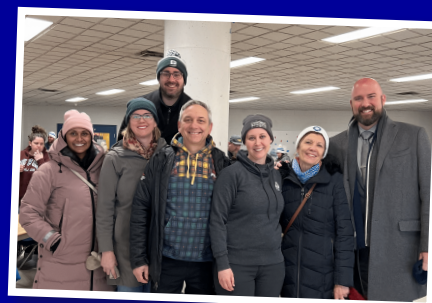
Team of Elected Officials at Coldest Night of the Year 2024

Whether it be for a tour to learn more about our programs and sites, or for attendance at one of our events, we are appreciative of each individual's time and interest MSL.