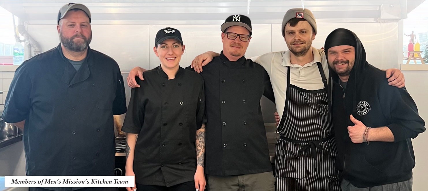
Members of Men's Mission's Kitchen Team